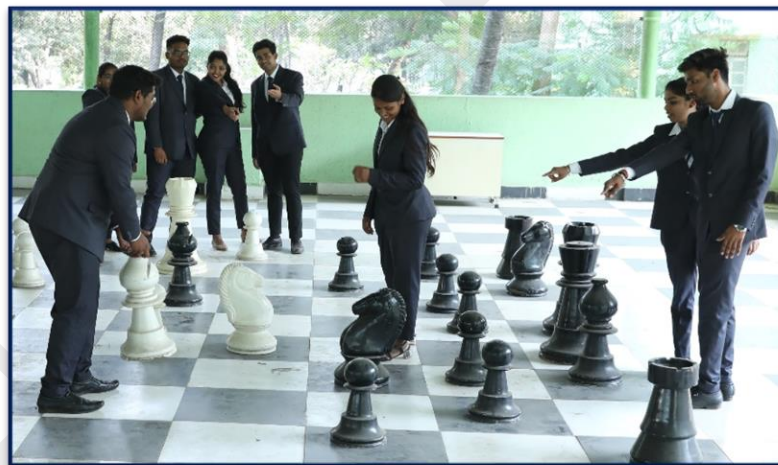
A special floor chess area with life-size chess sets on the 1st-floor terrace

Table tennis, chess, and carom are available for all students during working days.