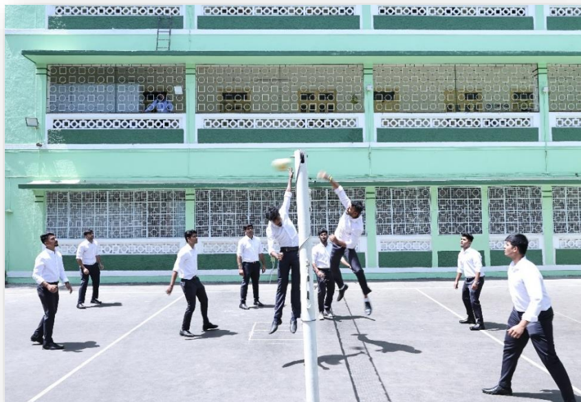
Outdoor Sports Facility